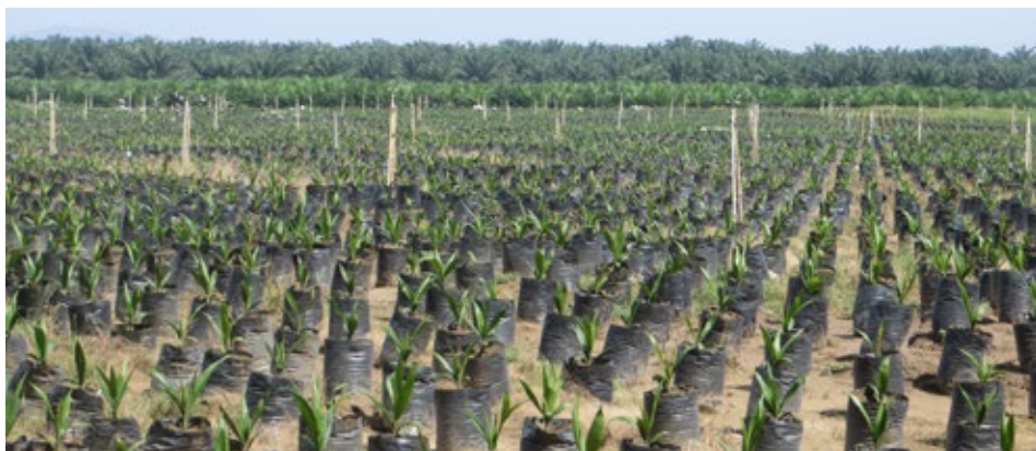
Dinant palm oil operations in the Aguán Valley, Honduras (CAO).

IFC's support to Dinant comprised a US$30 million corporate loan to expand the company's palm oil plantations, refinement, and distribution capacity in various regions of Honduras. Beginning in 2010, the World Bank received several complaints from local communities alleging forced and violent evictions of farmers by private and public security forces, as well as IFC's failure to respond appropriately. CAO initiated a compliance audit, which was completed in 2014 finding serious shortcomings in IFC's review and supervision of the project. IFC responded to the audit with an Enhanced Action Plan, which committed the client to Good