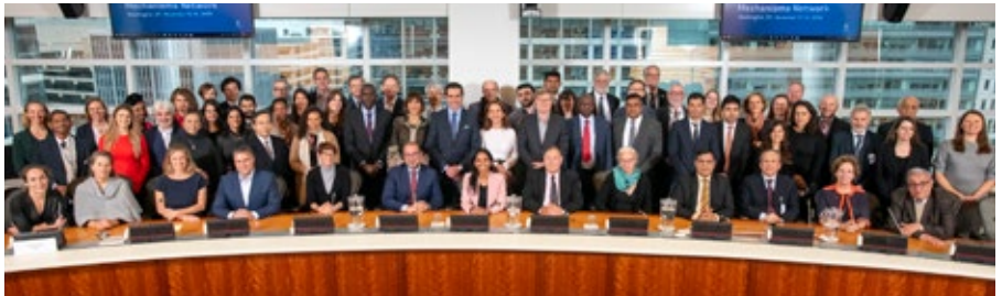
Participants at the 15th Annual Meeting of the Independent Accountability Mechanisms in Washington, D.C., November 2018.

In November 2018, CAO participated in the annual meeting of the Independent Accountability Mechanisms Network (IAMnet) , which was hosted by the World Bank Inspection Panel in Washington, DC. Some 50 participants representing accountability mechanisms from 20 international financial institutions participated. Over two days, staff from the mechanisms shared experiences from practice and discussed new tools and products. Topics included dispute resolution with public and private sector entities; how to address instances of reprisals experienced by complainants; and addressing gender-based violence complaints, among others. There was also a half-day session with a wide-range of civil society organizations to discuss opportunities and challenges for closer collaboration. The meeting was followed by a one-day academic conference at American University’s Washington College of Law on the occasion of the 25 th anniversary of the establishment of the Inspection Panel to reflect on the trajectory of the independent accountability mechanisms and future trends.