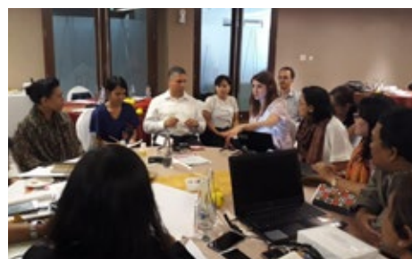
Indonesian CSOs participate in discussion with CAO and IPN staff during the Outreach Workshop in Bali, October 2018.

community groups, trade unions, and environmental organizations. The one-day workshop included presentations about CAO and the Inspection Panel, civil society reflections on their experiences engaging both mechanisms, and small group discussions on topics of interest. Key issues brought up by the CSOs included how to improve community access to the mechanisms, incidence of gender-based violence complaints, leverage of the mechanisms once a project is closed, and outcomes of specific cases in the palm oil sector in Indonesia.