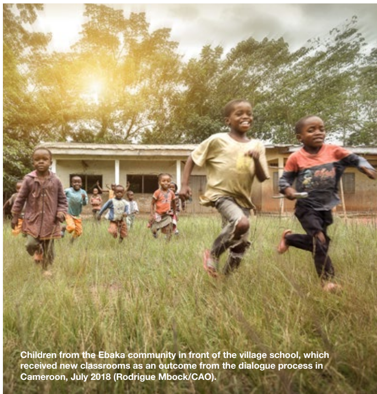
Children from the Ebaka community in front of the village school, which received new classrooms as an outcome from the dialogue process in Cameroon, July 2018 (Rodrigue Mbock/CAO).