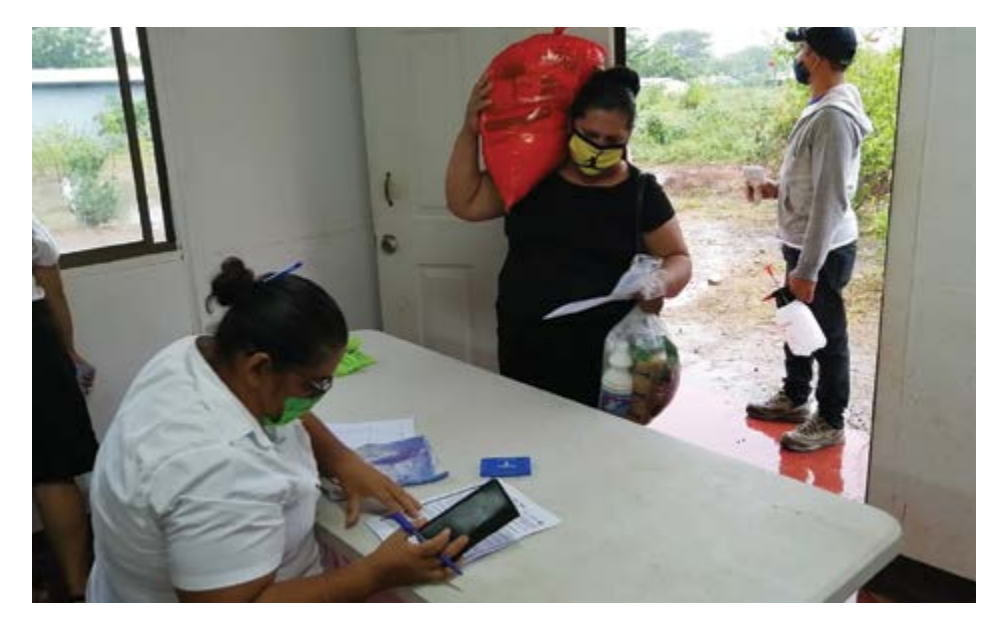
Community members gather to receive food and hygiene supplies.

begin operations shortly. As a response to the dire economic situation created by the pandemic and in coordination with additional donors including SOMO, a Dutch NGO, the company agreed to provide temporary food supply and a hygiene kit to AMBED's members. Parties have also completed their third participatory round of monitoring water quality and will soon disseminate results to community members. More information about the case is available on CAO's website.