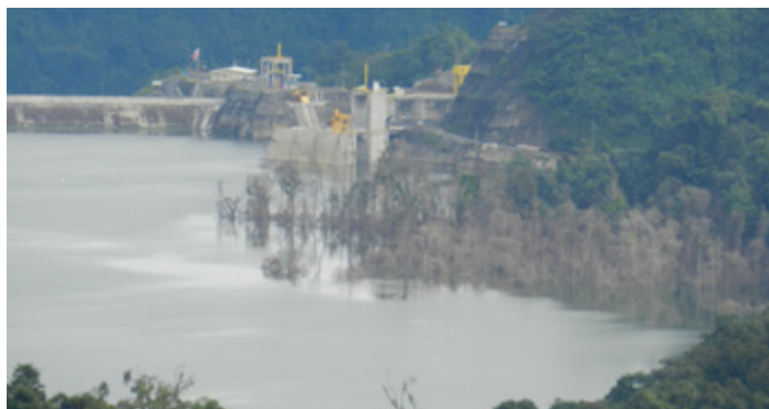
The Reventazón hydropower project, Costa Rica, November 2016.

The investigation was triggered by complaints to CAO from two local landowners who raise concerns regarding the project's land acquisition process, landslide risks, and potential impacts on biodiversity and greenhouse gas emissions. CAO's investigation is focusing on the issues related to land acquisition and livelihood restoration. It will