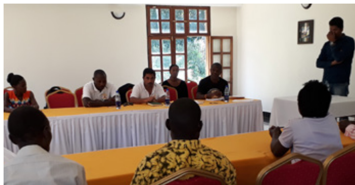
Parties discuss ways to work together to create economic initiatives in Kalangala, Uganda, December 2017.

CAO has concluded a dispute resolution process in Uganda between a small farmers association and Bidco Africa, a consumer goods company and IFC client. CAO closed the case after ascertaining that the land compensation agreement had been implemented. The dispute resolution process was convened to address a complaint sent to CAO in January 2017 by the National Association of Professional Environmentalists (NAPE) on behalf of 38 farmers living near palm oil plantations in Kalangala, near Lake Victoria. The plantations are operated by Bidco Africa's Ugandan subsidiary, Oil Palm Uganda Ltd (OPUL). The complaint raised concerns regarding the impacts of deforestation, environmental damage, lack of compensation for lost land, reduced