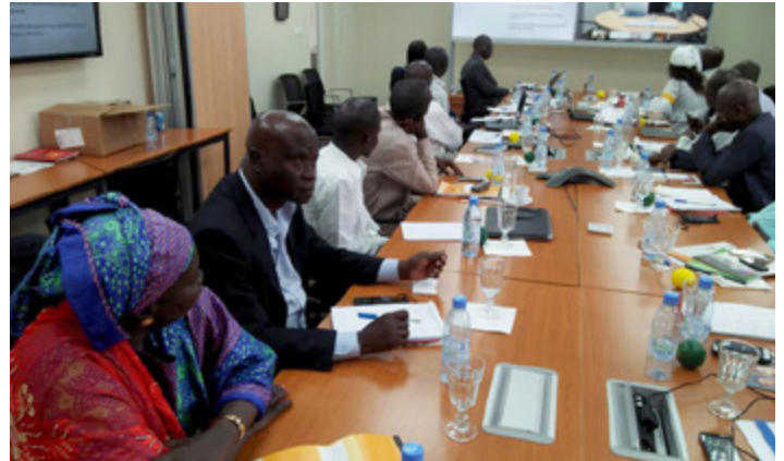
Civil society participants during the Senegal video conference, Dakar, Senegal, March 2018 (Photo: Aly Sagne).

CAO held video conferences with civil society organizations in Ghana and Senegal in December 2017 and February 2018, respectively. Both events included civil society