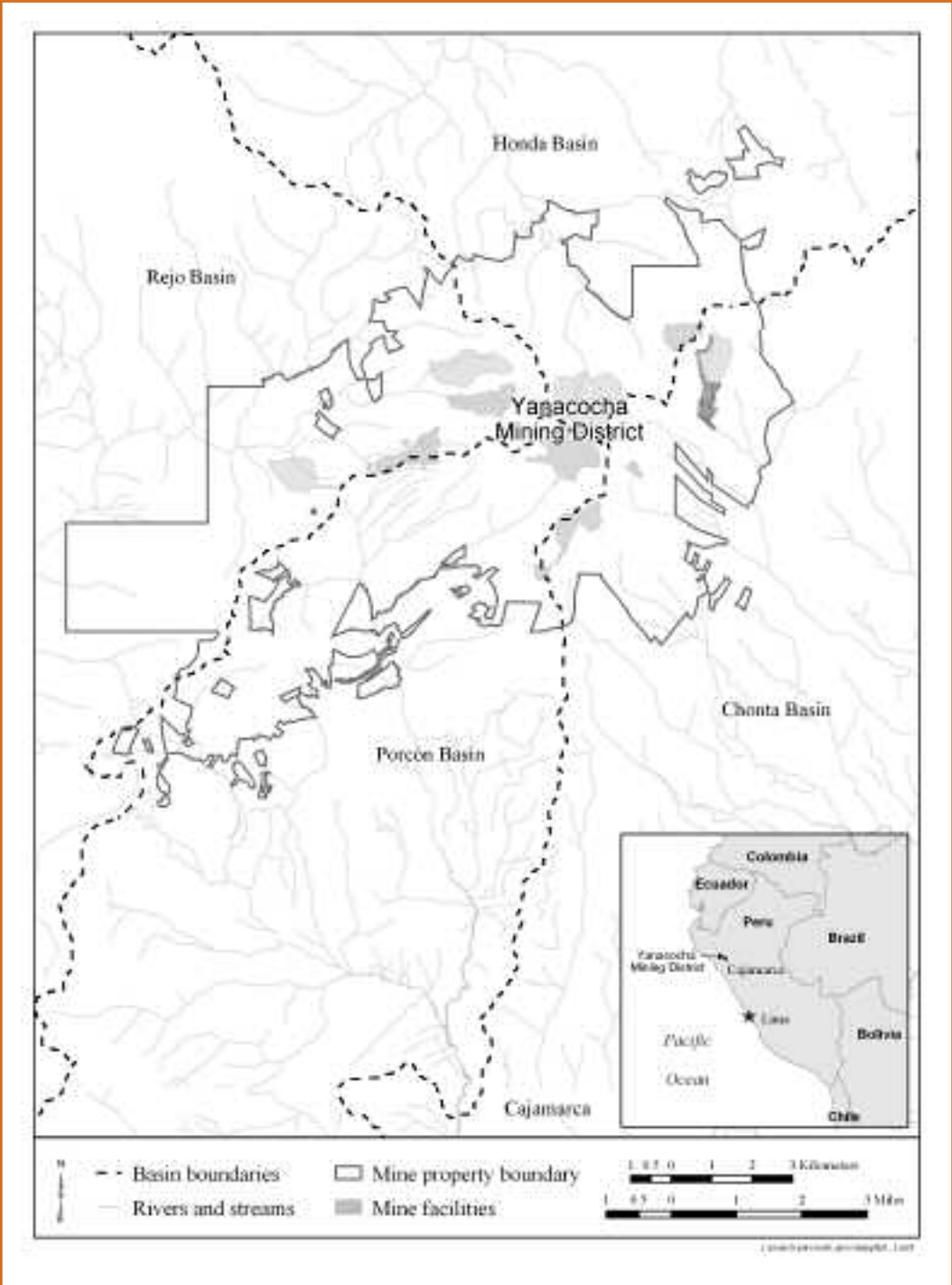
Map 1. The Yanacocha Mining District and Regional Watersheds