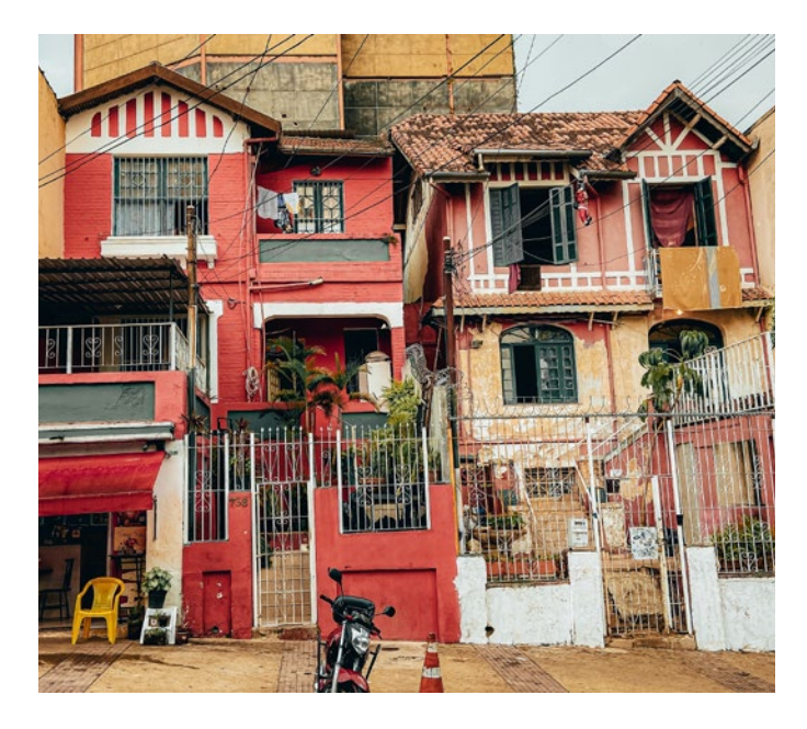
A residential street in Sao Paolo, Brazil.

logistics and health and safety measures, which resolved all the issues raised in the complaint. This process occurred entirely through online platforms (emails, Zoom, and WhatsApp). As CAO began monitoring the agreement in February 2022, Tembici announced its decision to move the location that was the subject of the dispute resolution process to a larger facility as part of its growth strategy. After the effective relocation of the support point, CAO released a public conclusion report on October 7, 2022, and closed the case.