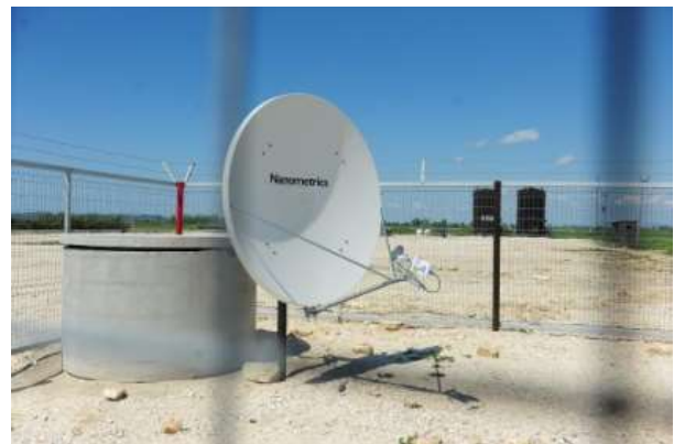
One of the two seismometers installed in the area of Patos-Marinza

In direct response to community concerns, Bankers, in consultation with the Institute of Geosciences, Energy, Water, and Environment (IGEWE), purchased two seismometers to enable improved national seismological monitoring, as well as increased resolution around the Patos-Marinza area. The seismometers were installed in locations identified by relevant experts.