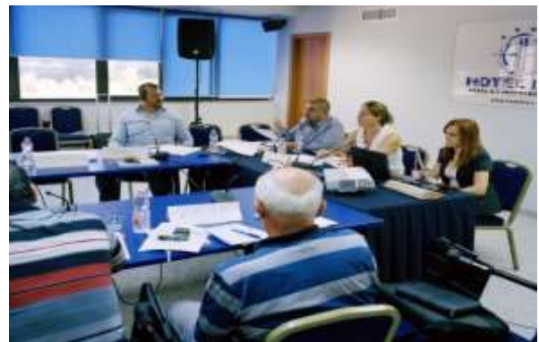
A community and company representative address the dialogue roundtable, September 2018

In May 2018, CAO conducted a coaching session on facilitation for a group of four roundtable members (community and company representatives), who will co-facilitate future meetings of the dialogue roundtable after CAO's exit. CAO observed two roundtable meetings in May and September 2018 as part of its monitoring role.