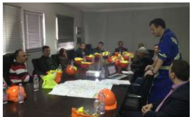
Parties prepare for a field trip to the company site, November 2015

Between 2015 and 2017, three field trips were conducted to provide an opportunity for community groups to see investments made by the company. These included investments related to technological and air quality improvements, and the installation of seismometers and waste management facilities.