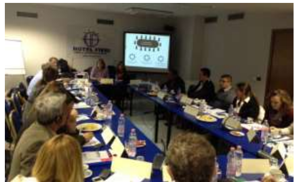
Community-company roundtable, at which parties agreed on ground rules for the dispute-resolution process, December 2014

The parties agreed that the dispute-resolution process would aim to: establish constructive dialogue, encourage shared learning, identify ways to improve the situation, improve channels of communication, build trust between communities and the company, and build a long-term cooperative process for addressing social and environmental concerns related to the project.