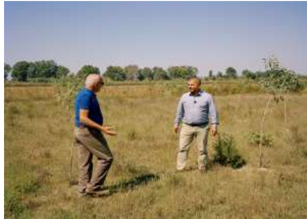
A community member and company representative visit a buffer zone where 18,000 trees have been planted over 10 hectares between production leases and local communities