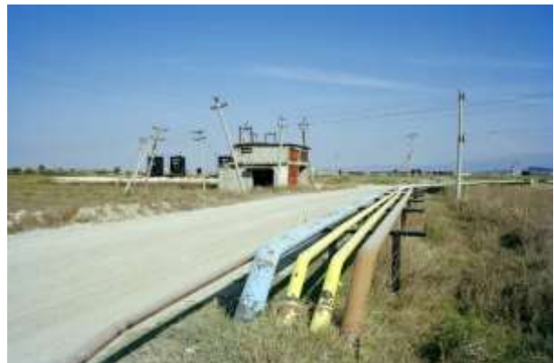
Pipes carrying oil, gas and water, built to reduce truck traffic, at the Patos-Marinza central extraction area