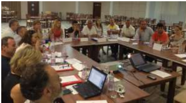
Capacity-building workshop with community members, July 2014

Prior to initiating parties' formal engagement in the dispute-resolution process, CAO worked closely with the community and local leaders to identify people with diverse backgrounds to participate in the process. Once identified, CAO convened a capacity-building workshop for community representatives to help them better understand techniques for effective communication, negotiation, and the principles of mediation. The first workshop took place in July 2014. This workshop also focused on developing a draft framework for dialogue.