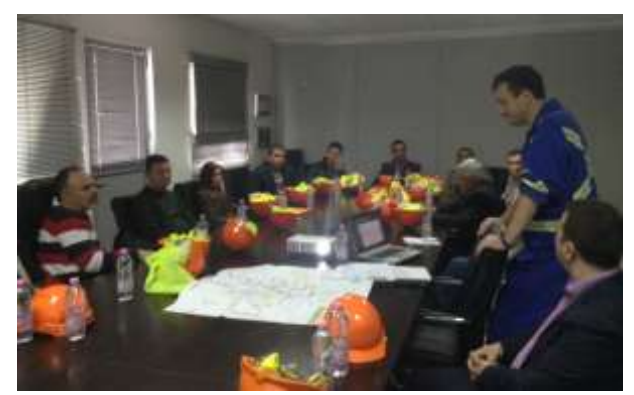
Parties prepare for a field trip to the company site, November 2015

Between 2015 and 2017, three field trips were conducted to provide an opportunity for community groups to see investments made by the company. These included investments related to technological and air quality improvements, and the installation of seismometers and waste management facilities.