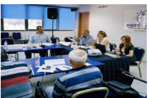
A community and company representative address the dialogue roundtable, September 2018

In May 2018, CAO conducted a coaching session on facilitation for a group of four roundtable members (community and company representatives), who will cofacilitate future meetings of the dialogue roundtable after CAO's exit. CAO observed two roundtable meetings in May and September 2018 as part of its monitoring role.