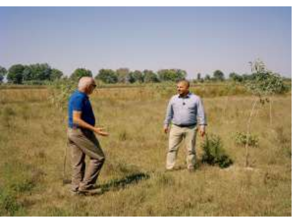
A community member and company representative visit a buffer zone where 18,000 trees have been planted over 10 hectares between production leases and local communities