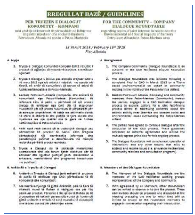
Guidelines approved jointly by community and company representatives, February 2018

and social impacts of Bankers Petroleum operations in the Patos-Marinza area.