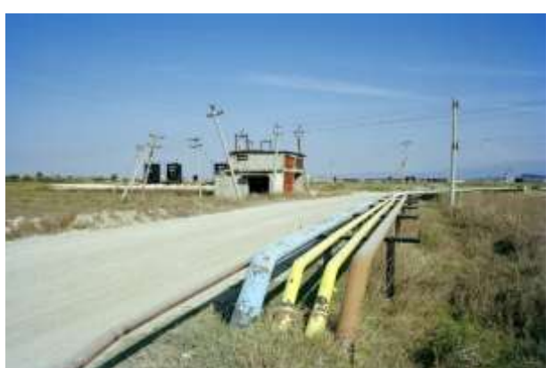
Pipes carrying oil, gas and water, built to reduce truck traffic, at the Patos-Marinza central extraction area