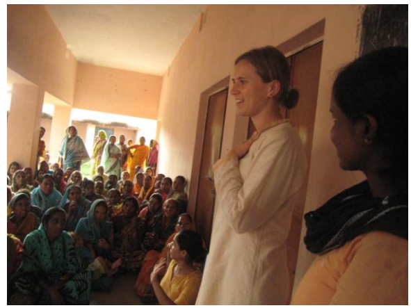
CAO's first assessment visit to affected communities

Between September 2011 and March 2012, the CAO team conducted four trips to meet with and hold numerous conversations with the complainants, the communities, the sponsor and operator, IFC's client, a relevant government official, civil society organizations and NGOs.