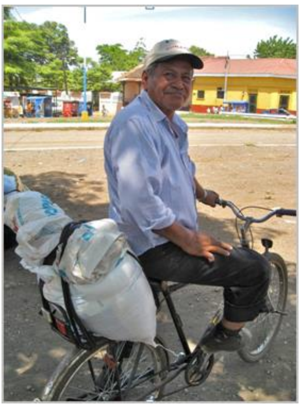
ASOCHIVIDA member transporting food aid support.

Since June 2009, responding to ASOCHIVIDA's request, NSEL has provided a monthly basic food allotment for ASOCHIVIDA's members, beginning with 1,100 and now reaching over 2,500 families (as well as school supplies for 1,545 children at the start of the school year). To date under this program, NSEL has provided over $4 million in food aid to community members.