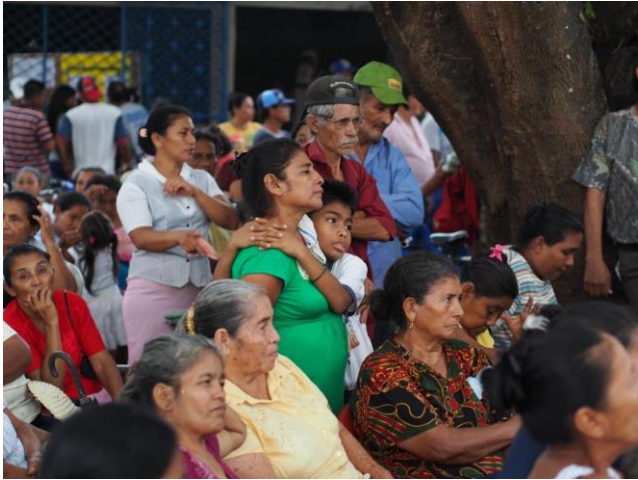
ASOCHIVIDA members who have lost their husbands or other family members to CKD

From 2008 until 2015, CAO worked with the complainants and company to initiate and sustain a dialogue process focused on finding joint solutions on the cause of the disease and ways to improve livelihoods and living conditions for the complainants, their families, and communities. This report summarizes the CAO dialogue process, its outcomes, IFC's role, and insights from CAO's perspective.