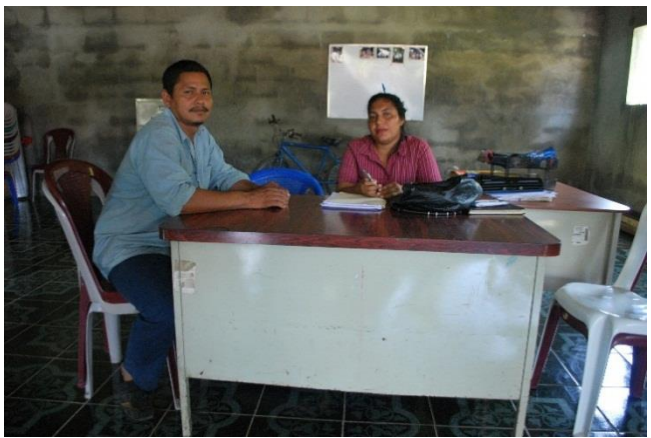
From this desk, ASOCHIVIDA tracks and allocates food supplies to 2,000 members each month.

By 2008, ASOCHIVIDA members had repeatedly been deceived by unscrupulous local leaders or lawyers who would assure them that the cause of their disease was already known and that proof of cause was being hidden from them. Therefore, when ASOCHIVIDA and NSEL jointly chose BU to respond to their questions about the causes of the disease, most ASOCHIVIDA members were expecting scientists to easily deliver evidence that would back their demand for economic compensation.