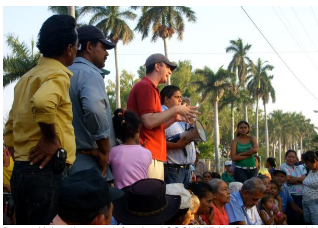
Boston University team informing ASOCHIVIDA's General Assembly about their research activities.

BU's research efforts, along with the efforts of other researchers during the past five years, have helped improve understanding of where CKD has been occurring in Nicaragua and in Central America. Though most of BU's work focused on Nicaraguan sugarcane workers, where the problem has been well described, BU also found evidence that CKD with these similar unique characteristics is also present in workers in other industries, such as mining, construction, and ports. Mortality data and the work of other investigators have shown that this disease is prevalent along the west coast of Central America - particularly in the Guanacaste region of Costa Rica and the Bajo Lempa region of El Salvador and in other countries, such as India and Sri Lanka.