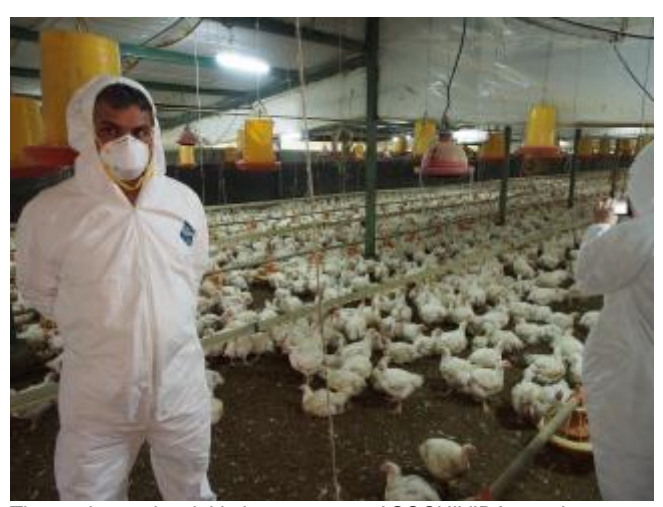
The poultry project initiative to support ASOCHIVIDA members

In 2012, NSEL purchased an industrial poultry production facility for $253,500 and since June that year, all profits generated by the facility have accrued to ASOCHIVIDA. Since 2013, this project has been generating a monthly profit of $1,500 for ASOCHIVIDA. This profit, soon expected to increase to $2,000, is used by ASOCHIVIDA to grow its medication fund, support members going through hemodialysis, helping those who have lost a family member, and general operational costs of the organization. NSEL will eventually transfer full ownership and administration of the facility to ASOCHIVIDA.