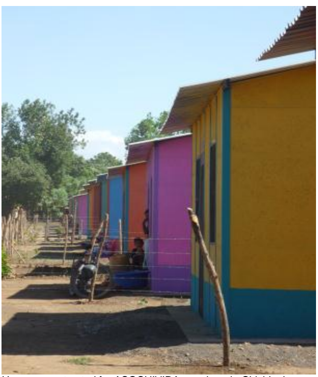
Houses constructed for ASOCHIVIDA members in Chichigalpa.

Colmena Foundation, <sup>11</sup> the National Housing Institute (INVUR), and the Municipality of Chichigalpa, 100 new houses have been built for members of ASOCHIVIDA who had lived in poor conditions. In addition, materials have been periodically to members to repair their existing homes. According to NSEL, the total budget for the project is in excess of $600,000.