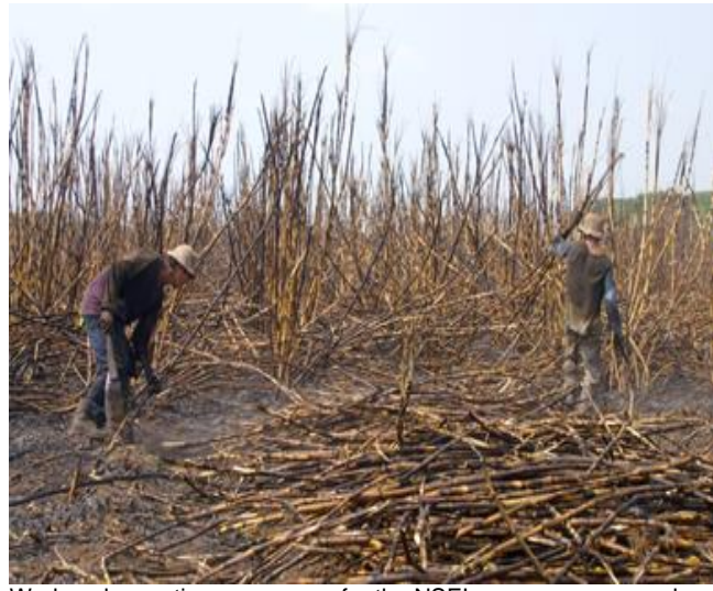
Workers harvesting sugar cane for the NSEL agro-energy complex

After finding the complaint eligible for assessment, CAO conducted three visits to Nicaragua between June and November 2008. Organizations involved had wanted the CAO to undertake a compliance review of the project, however at the time of the assessment, CAO's practice was that reaching a settlement meant the case would be closed after CAO's dispute resolution intervention and no compliance review would take place. During assessment, both NSEL and ASOCHIVIDA expressed their willingness to participate in a dispute resolution process (dialogue) facilitated by