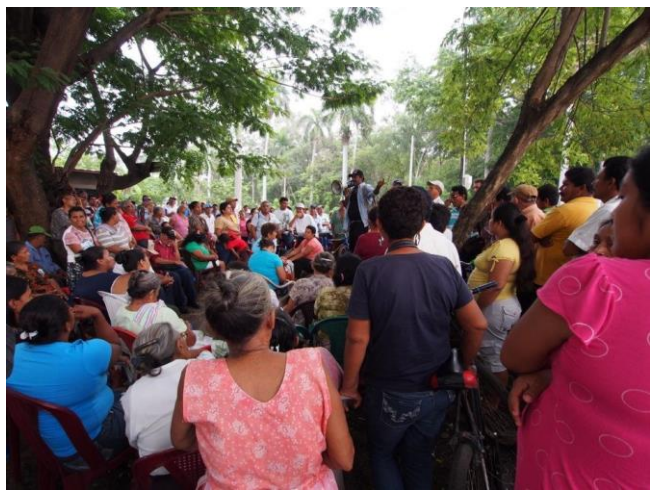
ASOCHIVIDA's General Assembly, which met frequently to discuss ways to help members deal with CKD.

Alongside NSEL, DEG has provided technical assistance to support entrepreneurial initiatives by ASOCHIVIDA members (implemented by a local development organization, NITLAPAN) and to further capacity building support transformation of ASOCHIVIDA into a stronger and more mature organization. 9 A business development and institutional capacity-building expert has been providing support to the parties since January 2010 to help identify incomegenerating activities. This expert assistance was provided under CAO's auspices for four years and was taken on board by DEG in 2014. These activities are described in more detail below.