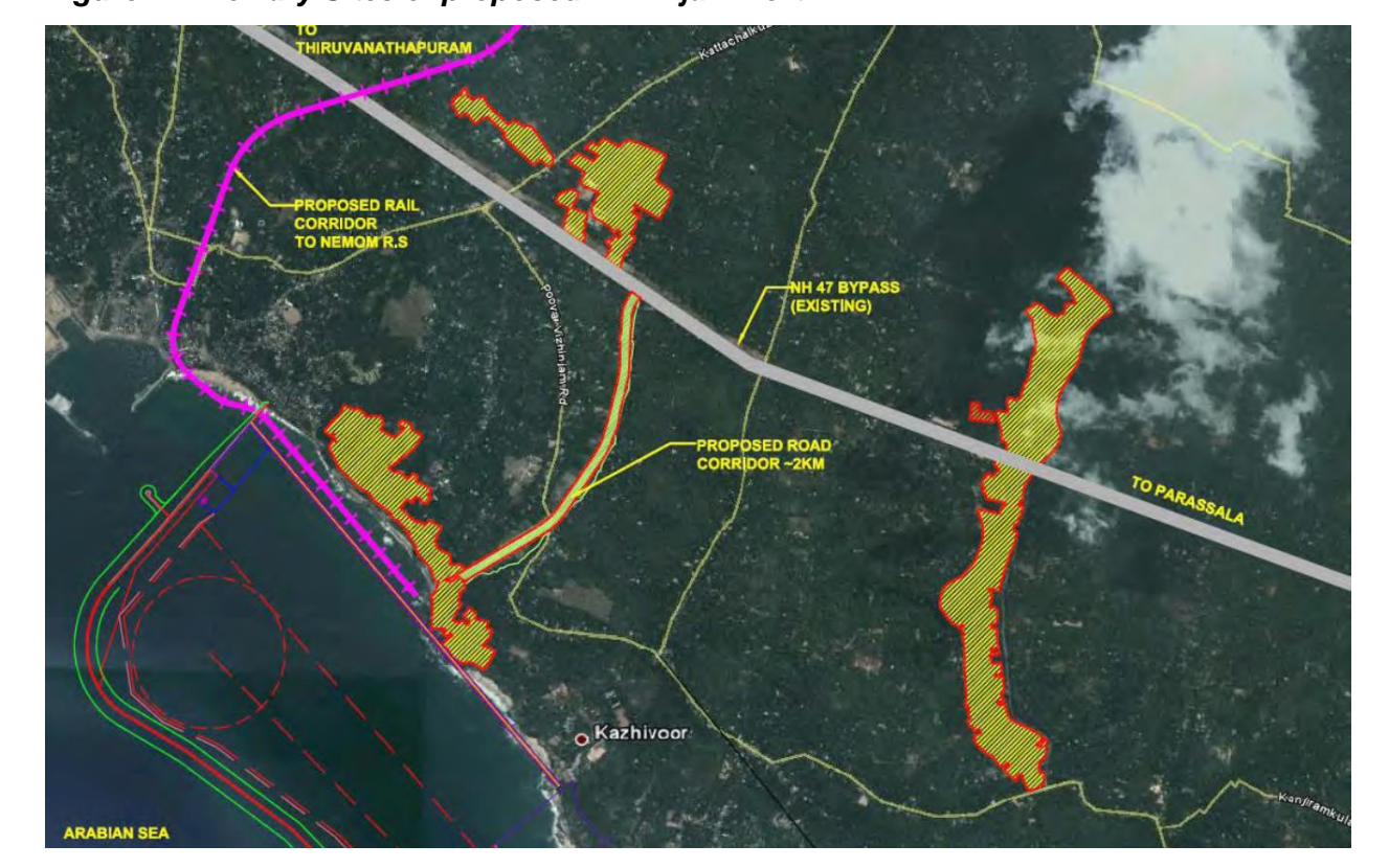
Figure 2: Ancillary Sites of proposed Vizhinjam Port