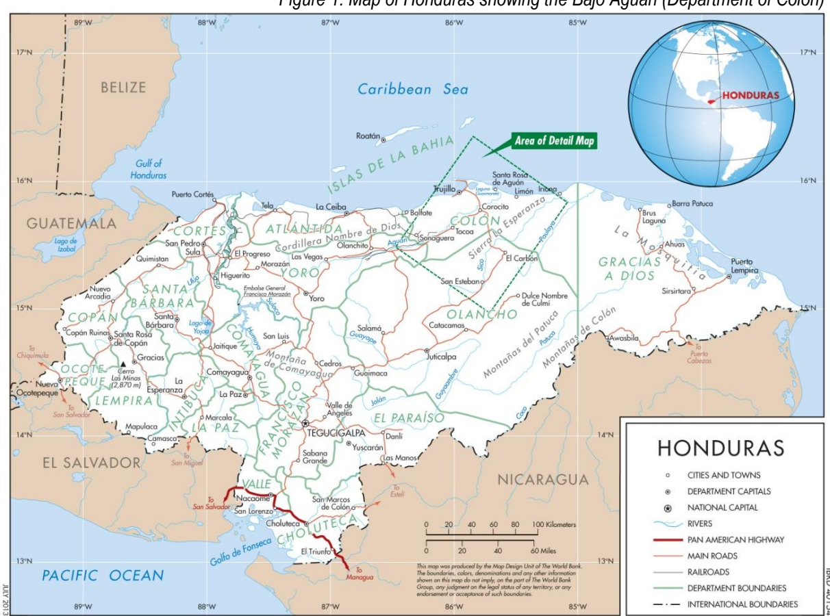
Figure 1. Map of Honduras showing the Bajo Aguán (Department of Colón)

In considering the adequacy of IFC's E&S performance in relation to this project, CAO has been conscious not to expect performance at a level that requires the benefit of hindsight; rather the question in relation to each requirement is whether IFC teams exercised reasonable professional judgment and care in the application of relevant policies and procedures based on contemporaneously available sources of information.